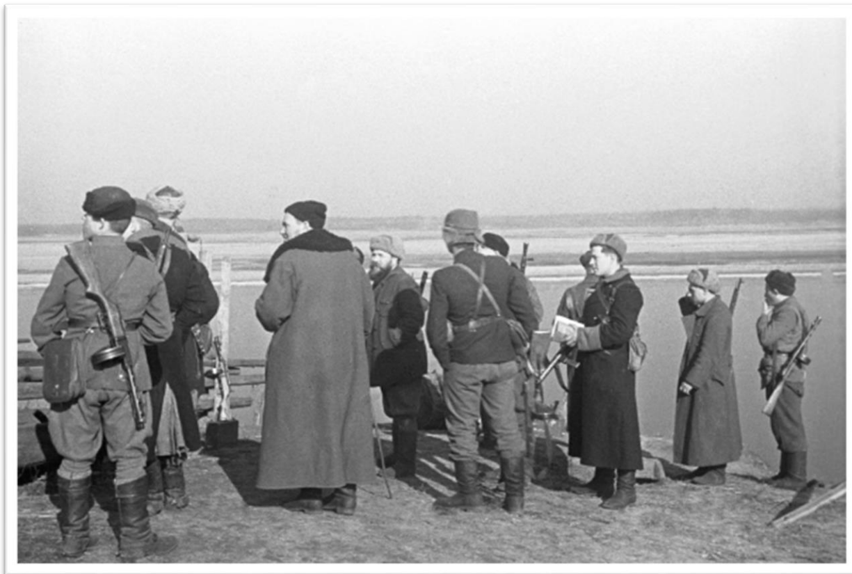
Sidor Kovpak (center) discussing the details of the military operation with the commanders of the detachments, 1942.

At the end of November 1941, the Hitlerite command felt that it practically had no control over the area of Putivl. Loud actions of partisans changed the attitude of the local population, which began to look at the invaders almost with a mockery - they say, are you in power here? The real power is in the forest!